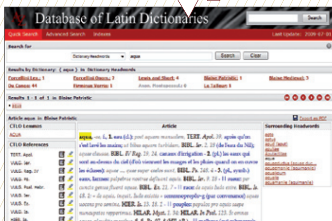
Entry “aqua” in the Database of Latin Dictionaries